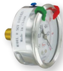
SGY back with accessory pointers