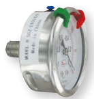
SGZ back with accessory pointers